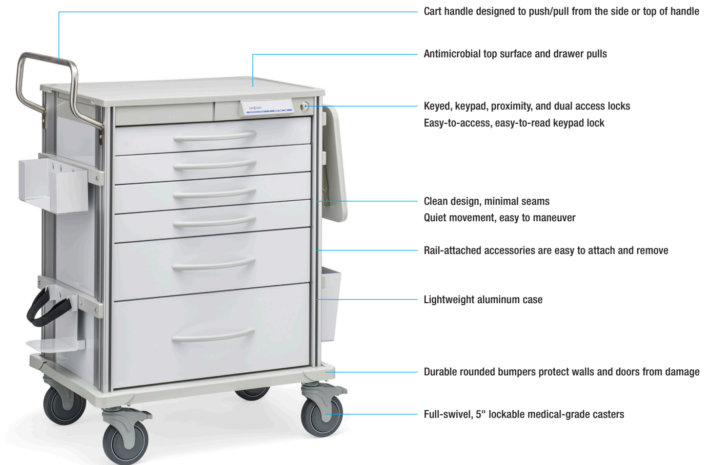
Product Shown: Pharmacy Cart (SP27W6 with SPPVP)

Pace carts are mobile, easy to maneuver, secure, and adaptable to change. The Pharmacy Cart has a glove box holder, flip-up work surface, chart holder, disinfectant holder, push handle, 2 security lock boxes, and 2 3"-high pharmacy trays. A variety of drawer configurations and exterior and drawer accessories lets you target supply storage for specific treatments and departments.