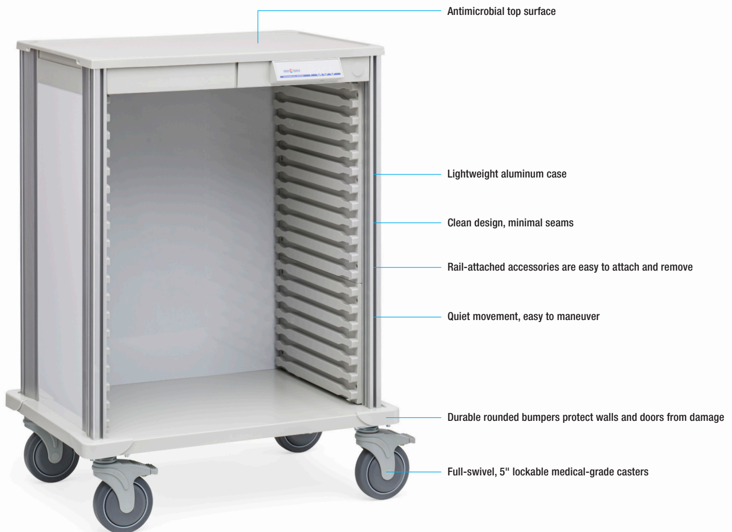
Product Shown: FlexCell Cart (SP27WC)

Pace carts are mobile, easy to maneuver, secure, and adaptable to change. The FlexCell Cart has an open front and full FlexCell interior. It has a white case. A variety of exterior accessories lets you target supply storage for specific treatments and departments.